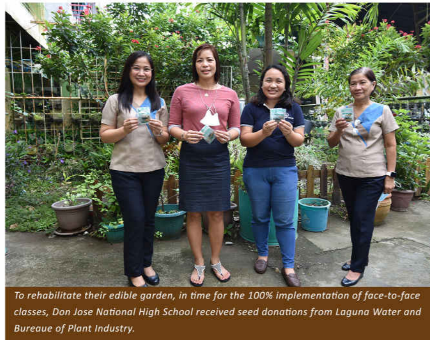
To rehabilitate their edible garden, in time for the 100% implementation of face-to-face classes, Don Jose National High School received seed donations from Laguna Water and Bureau of Plant Industry.