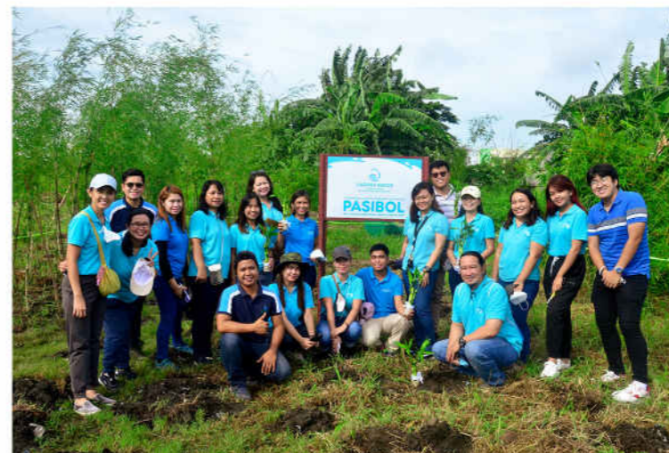
Laguna Water adopted a portion of the 13-hectare land dedicated by the City Government of Santa Rosa as a bamboo planting site. Fish pole bamboos were planted in the area to prevent siltation and soil erosion in Laguna Lake.

conducted the tree planting in Canlubang Golf to commemorate Cabuyao's 10th cityhood anniversary on August 1, 2022. A simultaneous planting of the kabuyaw tree, where the city's name originated, was also conducted in various institutions and landmarks, among which is Laguna Water's facility in Matang Tubig Spring where two seedlings were planted.