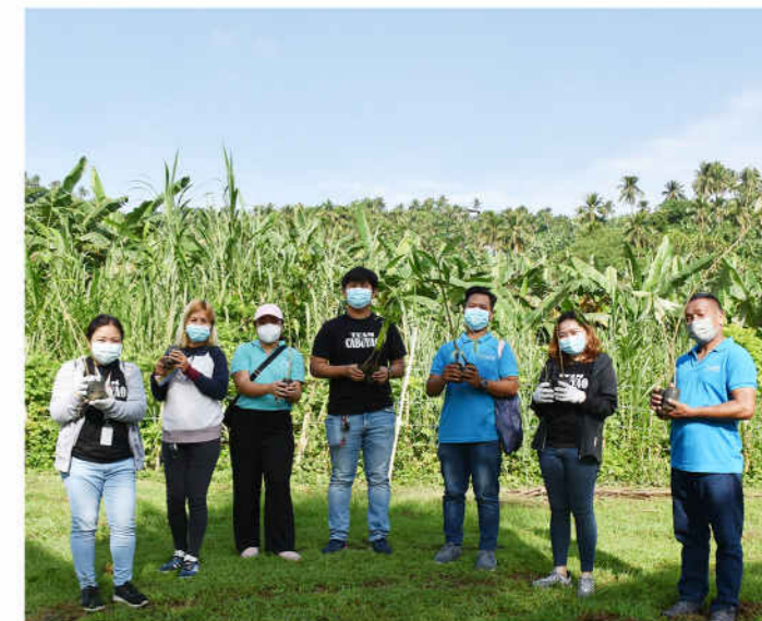
Volunteers from the Cabuyao Business Zone planted two seedlings of the kabuyaw tree in Laguna Water's facility in Matang Tubig Spring.

Another activity spearheaded by the group is a community engagement day in Brgy. Diezmo, Cabuyao to support the International Coastal Cleanup Month where employees of member organizations and residents joined hands in a tree planting and community cleanup session. Laguna Water also hosted an interactive learning session about proper wastewater management and disposal. The combined efforts of the group assures that an integrated approach is adopted in protecting the Cabuyao River.